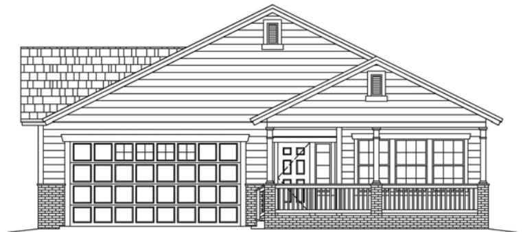
Front El evati on

House is sold through a bid-process, all bids will be considered. Bids are due by 1pm, May 20, 2009 , to: ACE High School, 2800 Vassar Street, Reno, NV, 89502